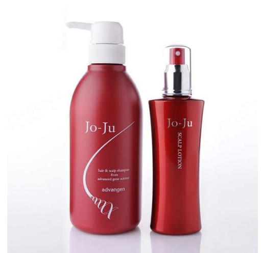
Figure 1: Advangen shampoo and Women's and Men's scalp lotion.